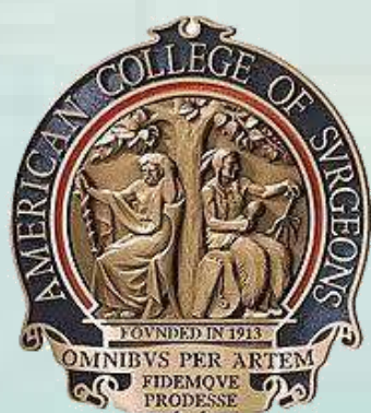
ACS Chapter India